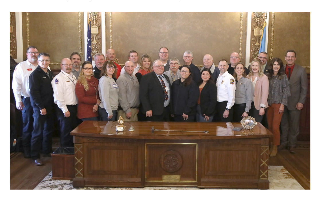
2022 EMS Day Picture

Sponsored by South Dakota Emergency Medical Service Association (SDEMSA), South Dakota Ambulance Association (SDAA), and SDEMSA IC Society.