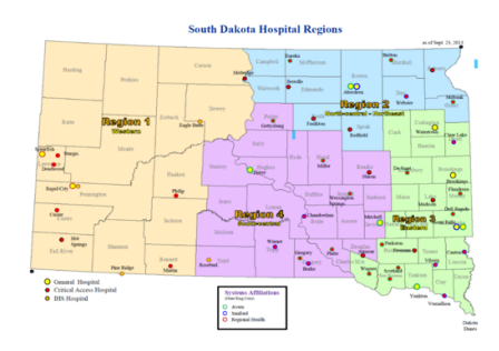
Regional Trauma Performance Improvement State Calls 2023