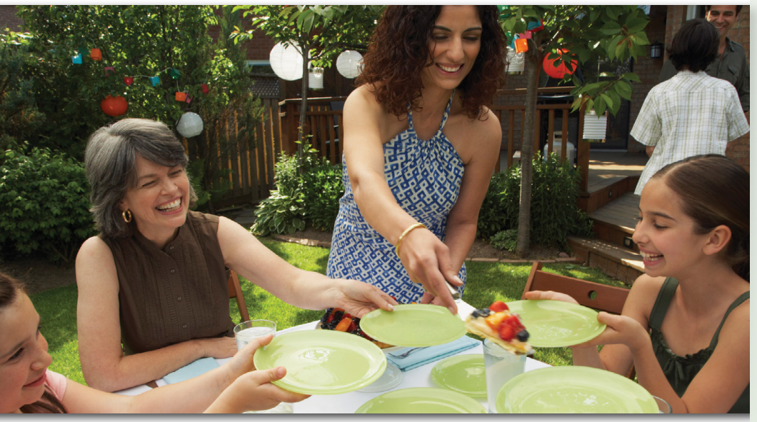
Cut back on sweets by serving fresh fruit for dessert.