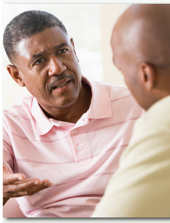
Helping a loved one cope with diabetes begins with talking.