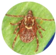
Dermacentor variabilis AMERICAN DOG / WOOD TICK