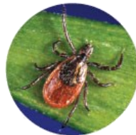
Ixodes scapularis BLACKLEGGED TICK