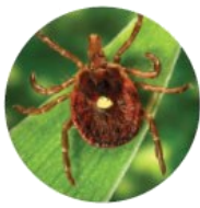
Amblyomma americanum LONE STAR TICK