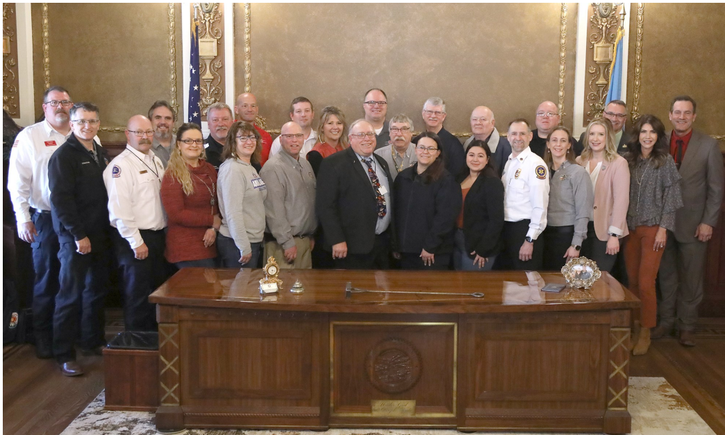
2022 EMS Day Picture

Sponsored by South Dakota Emergency Medical Service Association (SDEMSA), South Dakota Ambulance Association (SDAA), and SDEMSA IC Society.