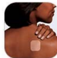
Upper torso (front and back except on your breast)