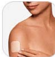
Upper outer arm